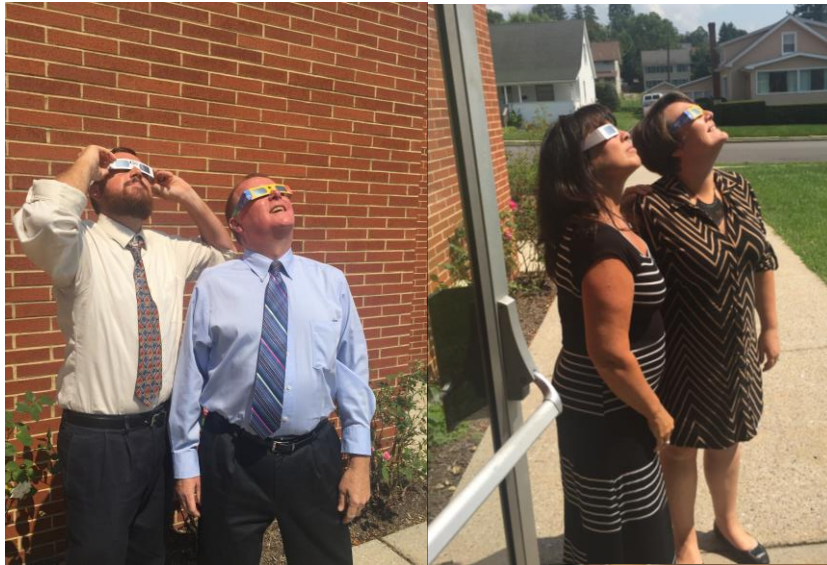
Middle School Teachers Checking out the eclipse during their in-service in August.