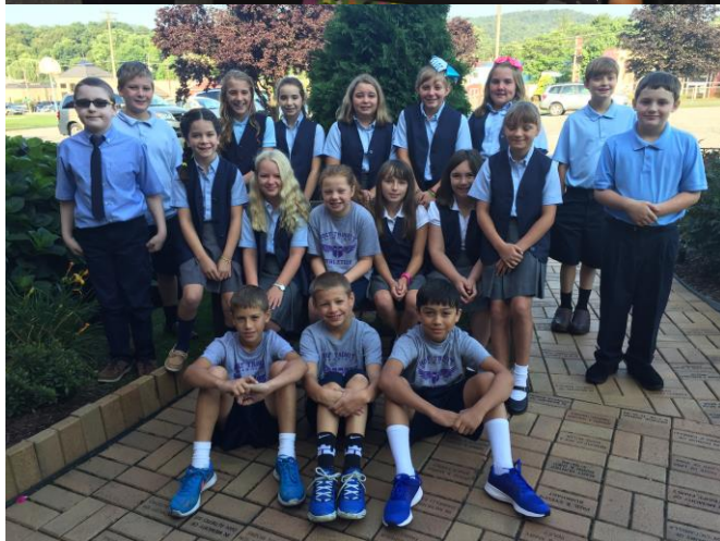
Adjusting to life as a middle school student.